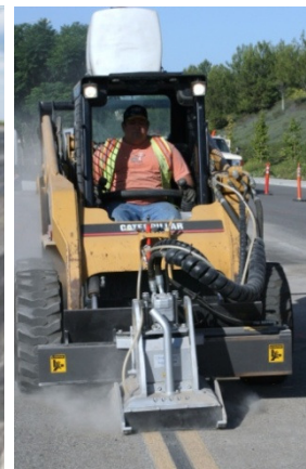
Skid-steer driven planer/grinder for up to 3,000 lf per hour

Well maintained equipment – Flexible responsive scheduling