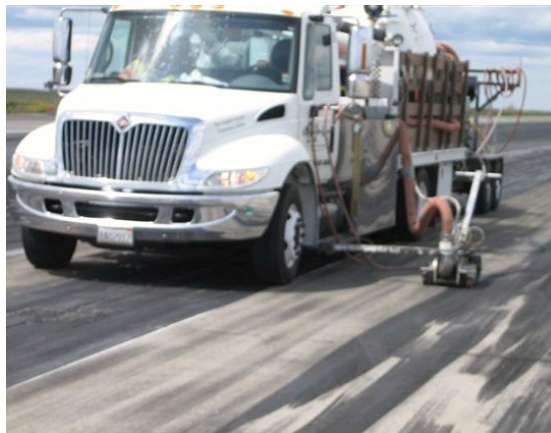
Rubber removal using ultra-high waterblasting with vacuum recovery